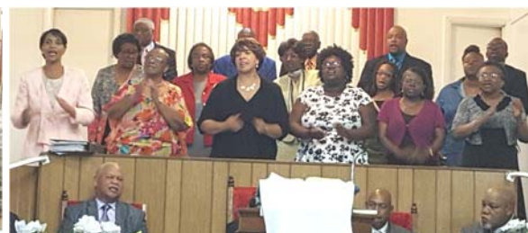
Ramah M.B. Church Mass Choir